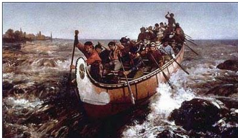
Shooting the Rapids, 1879 by Frances Anne Hopkins (1838–1919)